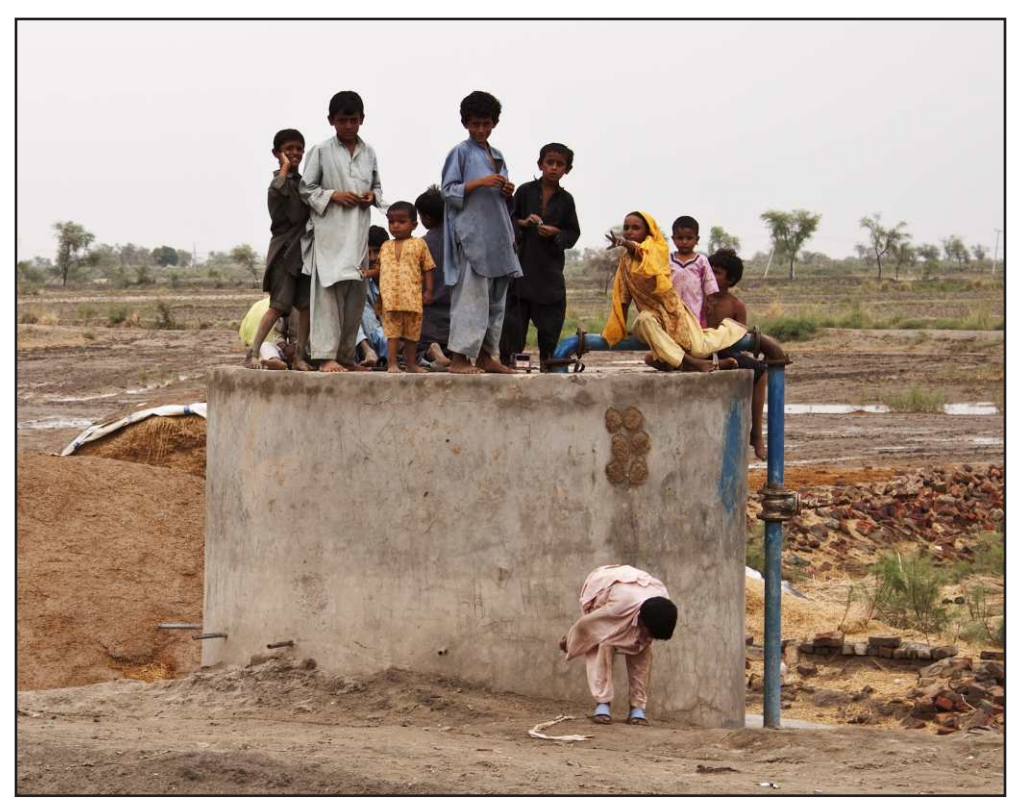
Construction of water supply system on village common land in Jacobabad, Sindh, Pakistan