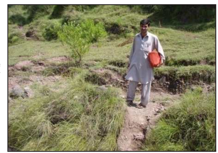
Typical Patwari with his basta

official in the Revenue hierarchy but is the linchpin of the land administration. The functions performed by the Patwari make him the most important official of Revenue Department. Patwari has a big "Basta" (bag) to maintain all the land revenue record.